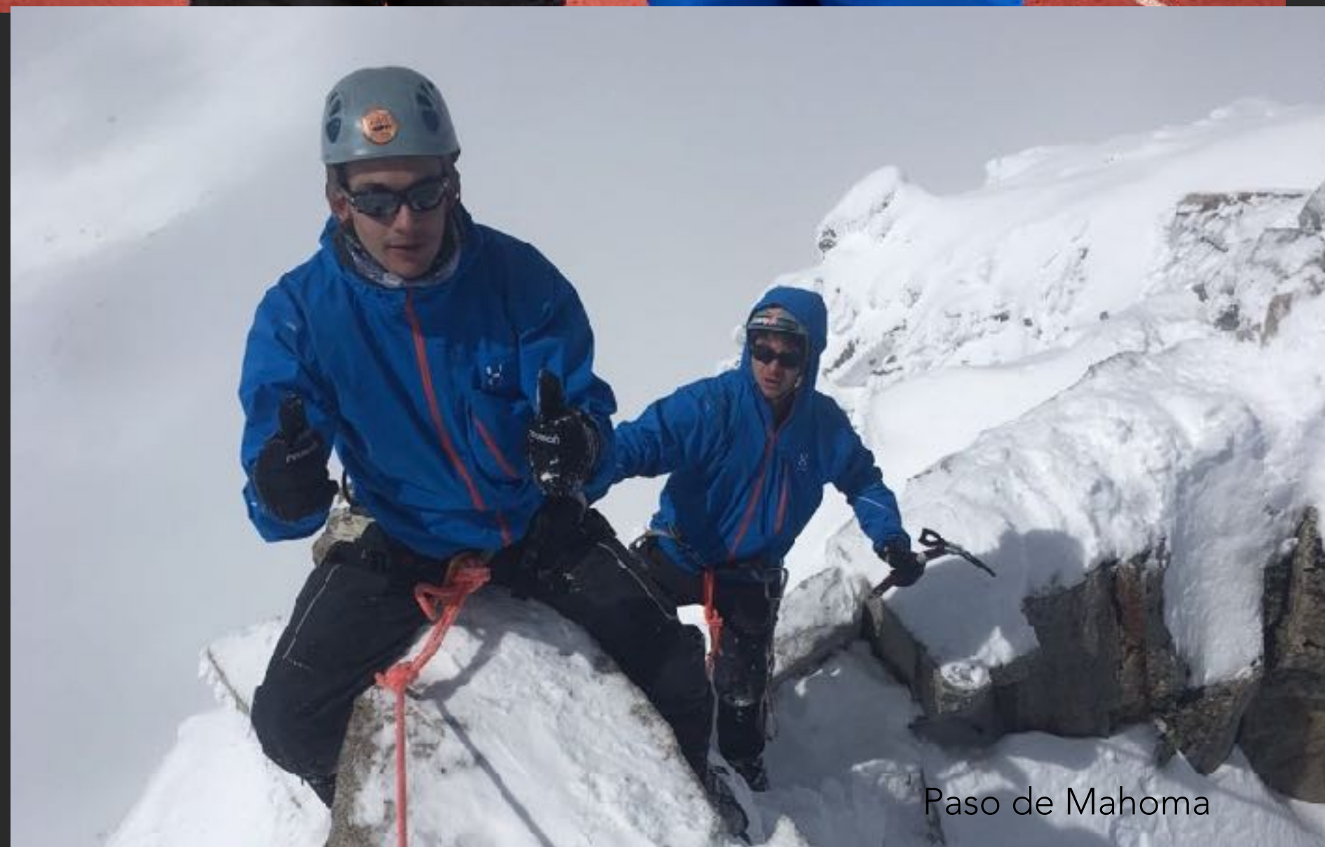
Paso de Mahoma

"Athletics and high performance are very hard... Training, we suffer to the point of exhaustion every day. This has made us develop very powerful physical and mental capacities that have served us well in our other passion - the mountains."